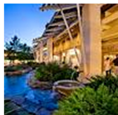
Shops at La Cantera 5 Miles