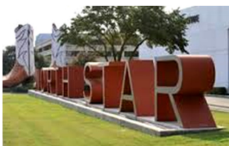
North Star Mall 5 Miles