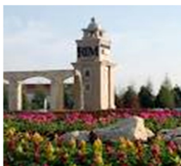
Rim Shopping Center 5 Miles