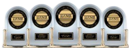
J.D. POWER & Associates 2015 YTD #1 in Overall Satisfaction