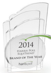
Luxury Hotel BRAND OF THE YEAR