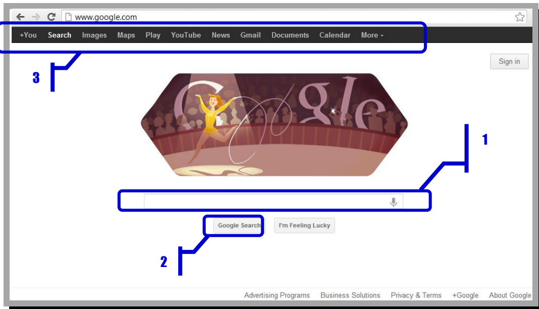
Figure 1. The Google User Interface

Google's "free" and easy-to-use Internet search service begins with a very familiar user interface (or home page). Using a web browser such as Google Chrome®, Mozilla Firefox®, Internet Explorer®, or Safari®, the web address, www.Google.com , is entered as shown in Figure 1. By entering a keyword (or phrase) in the search box (section 1) and clicking the "Google Search" button (section 2), a basic user-initiated search can be requested. In addition to using the Google home page to search relevant results on the World Wide Web, users are also able to perform specific searches (i.e., You, Search, Images, Maps, Play, YouTube, News, Gmail, Documents, Calendar, and More) by clicking the links located at the top of the Google page (section 3).