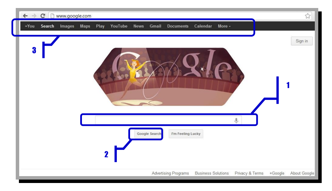
Figure 1. The Google User Interface

Google's "free" and easy-to-use Internet search service begins with a very familiar user interface (or home page). Using a web browser such as Google Chrome®, Mozilla Firefox®, Internet Explorer®, or Safari®, the web address, <a href="www.Google.com">www.Google.com</a>, is entered as shown in Figure 1. By entering a keyword (or phrase) in the search box (section 1) and clicking the "Google Search" button (section 2), a basic user-initiated search can be requested. In addition to using the Google home page to search relevant results on the World Wide Web, users are also able to perform specific searches (i.e., You, Search, Images, Maps, Play, YouTube, News, Gmail, Documents, Calendar, and More) by clicking the links located at the top of the Google page (section 3).